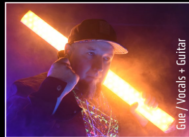
Gue / Vocals + Guitar